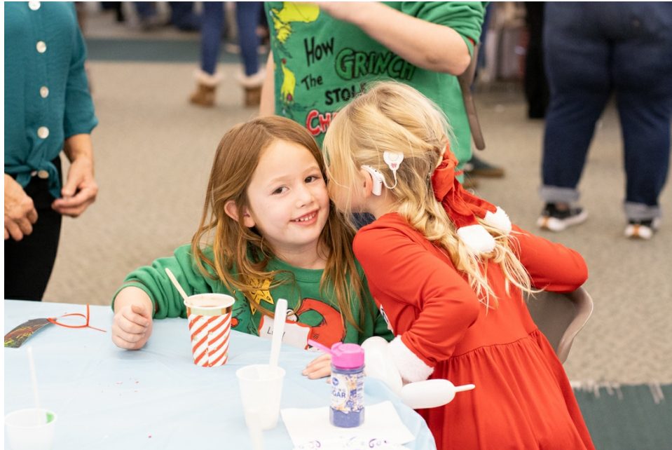
Two young attendees share a secret.