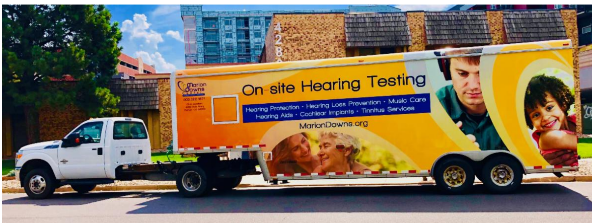
Marion Downs Center's On-Site Hearing Testing Trailer