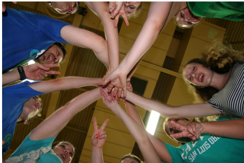
Teenagers during a Campus Connections activity

FOR DEAF AND HARD OF HEARING/DEAF-BLIND TEENAGERS SEEKING SEEKING POST-SECONDARY EDUCATION AND/OR EMPLOYMENT