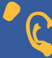
Bone Anchored Hearing Aids